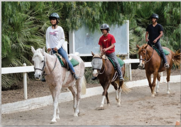
Learning to "Post"