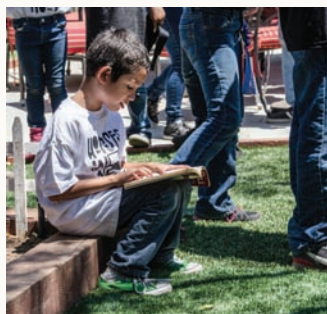
Boy Reading 'Happy Horsemanship'

"Thank you to our donors who care about the people we serve."