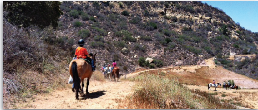
Shields Trail Ride