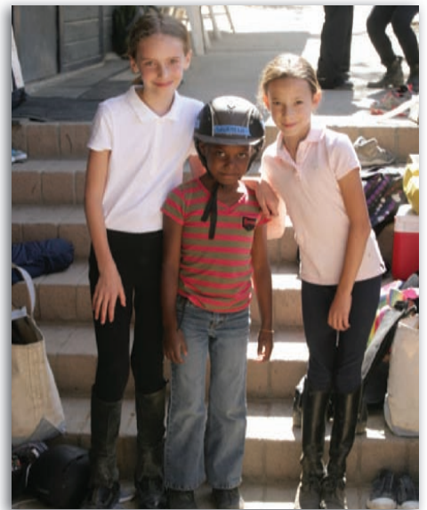
Camper from Nickerson Gardens with "wonderful volunteers"!